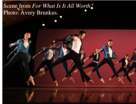
Scene from For What Is It All Worth?